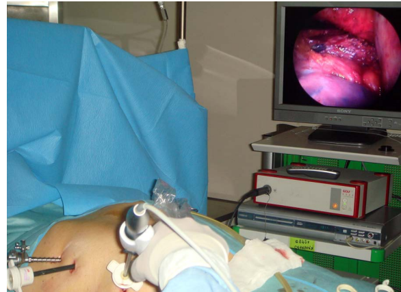
Figure 2. Patient in the prone position with excellent ergonomics showing the position of the three ports and surgical instruments in place.

During the last decade, distal esophagus through the left chest has lost its popularity with laparoscopic techniques