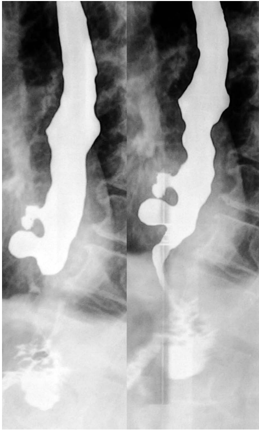
Figure 1. Two small diverticula in the distal esophagus and a tight gastroesophageal junction on barium swallow.

line was done. Two other incisions (1 cm each) were placed behind the tip of the scapula in the fourth ICS and paravertebrally in the eighth ICS. An extra 1-cm incision in the seventh ICS posterior axillary line was necessary in the second and third patients for traction (Figure 2). The thoracic cavity was insufflated with carbon dioxide and long esophageal myotomy was performed using hook electrocautery or ultrasonic shears (Figure 3). Significant inflammation and adhesions were present in all patients. Contralateral pneumothorax necessitating a chest tube insertion occurred during dissection in the second patient. Air was injected rapidly through a nasogastric tube to check for any esophageal leakage after myotomy. A single 28-Fr chest tube was placed in all patients. Operating times ranged from 120 to 180 min. The first and third patients were discharged on the third postoperative day. While the second patient with COPD had hypercapnia postoperatively and was kept intubated for 24 h and discharged on the fifth postoperative day. All patients had significant improvement in their symptoms and gained weight after the operation.