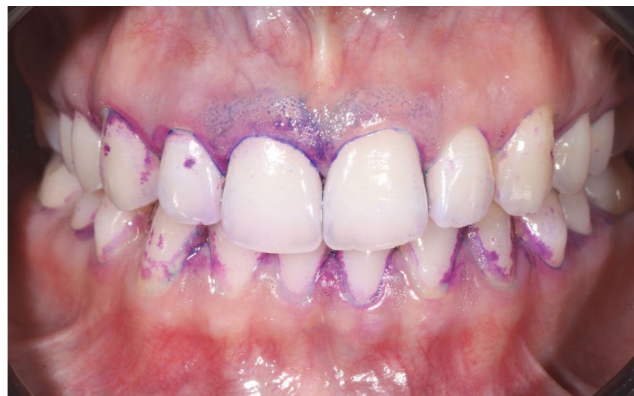
Fig. 2. Intraoral photograph of a participant captured using a professional digital camera (Canon EOS 700D; Canon Inc, Tokyo, Japan) and a macro lens (Canon EF 100 mm 1 : 2.8 L IS; Canon Inc) after the application of a dental plaque staining agent.

During the initial session, the Turesky Modified Quigley-Hein Plaque Index was clinically measured using a periodontal probe to detect any plaque accumulation. After assessing the plaque index, teeth were stained with a dental plaque staining agent (Tri Plaque ID Gel; GC Corporation). Following the staining procedure, intraoral photographs