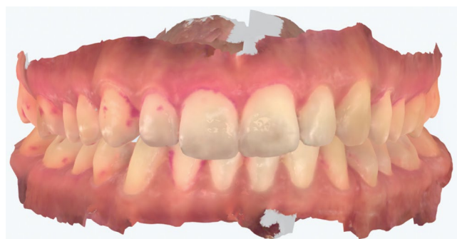
Fig. 4. Intraoral scanning image of a participant captured by an intraoral scanner (iTero Elements 2; Align Technologies, San Jose, CA, USA) following the application of a dental plaque staining agent.

Statistical analyses were conducted using SPSS version 23 (IBM Corp., Armonk, NY, USA). The Shapiro-Wilk test was employed to assess conformity to the normal distribution. Pearson correlations were computed to compare changes by group. Linear models were employed to compare dental plaque values by group, time, and method. The Tukey honestly significant difference test was used for multiple comparisons. In the qPCR analysis, the Kru-