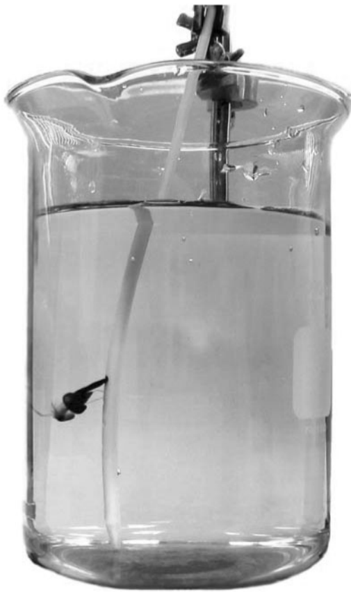
Fig. 3. Leak pattern demonstrated with methylene blue injection. Leak from the proximal side hole.

Clinically, we use a heparin concentration of 5000 U/ml to lock these catheters. The volume of leakage we have observed in this study correlates to inadvertent intravenous administration of 2300–4250 U of heparin with each locking procedure. This amount may double when 10 000 U/ml of heparin is used. Leakage of lock solution begins when ~80% of the lock solution is injected. When the catheter filling volume is injected, the mean concentration at the tip of the catheter is ~90% of the locking solution's concentration [1]. Dialysis catheters may also be filled with higher volumes than the catheter volumes using diluted heparin solutions to prevent clotting [8]. Polaschegg and Shah recommended 20% overfill of the catheter with the locking solution to achieve full strength [1]. The present work suggests that leakage of catheter lock solution increases significantly with 20% overfill of locking solution. One should consider possible unwanted systemic effects of locking solution, especially when overfill volume is used.