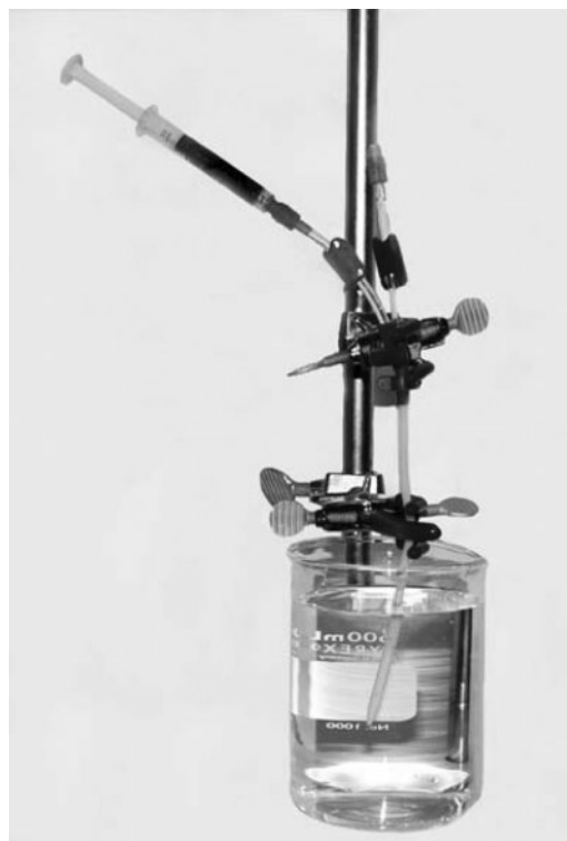
Fig. 1. In vitro model used to test the catheters.

Each catheter was flushed and locked with distilled water. The tip of the catheter was immersed into a test tube containing 50 ml distilled water. The tip of the catheter was positioned at a depth of 10 cm to mimic central venous pressure of approximately 6–8 mmHg. After positioning, each catheter lumen was filled and locked with a 5% dextrose solution, using the volumes indicated on the catheter by the manufacturer. Injection time was 2 s for each port. The catheter was removed within 5 s and the solution in the test tube stirred with a magnetic stirrer, and then a sample of 2 ml was obtained from the test tube to measure dextrose concentration in the test vessel. The procedure was repeated three times on each catheter for reproducibility. The same experiment was then performed using 20% greater and 20% less dextrose volume than catheter volume. All procedures were performed by the first two authors using a standardized method.