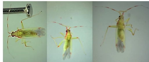
Figure 1. Stereo-microscopic appearances of Campyloneura virgula

Campyloneura virgula is truly omnivorous and can survive by hunting small insects, such as aphids and red mites, as well as plants, making it a destructive pest (2). Adults can be found on and around a variety of deciduous trees from July to October, while the nymphs emerge in May. Mirids which C. virgula was classified, are also known as small plant bugs that feed on plants. Although they can bite humans, it is relatively uncommon. The reasons for this behavior are unknown, and the transmission of pathogens from mirids to humans was not confirmed. The possibility of any diseases related to C. virgula is also unknown (2, 4, 5). While there have been a few reported cases of mirids biting humans, little information is available about the clinical effects and consequences of C. virgula human biting and it is the first case report of human biting C. virgula in Türkiye.