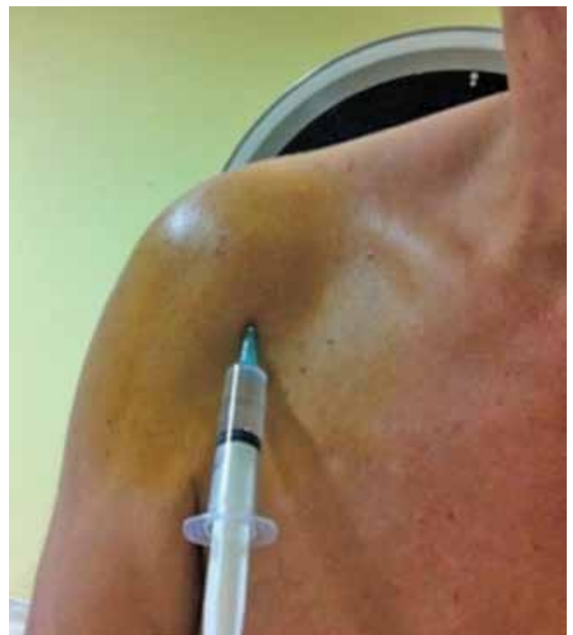
Figure 1. Intra-articular shoulder injection. Injections were performed with anterior approach.

Eight patients (47%) (6 females and 2 males) had adhesive capsulitis while nine patients (53%) (5 females and 4 males) had impingement syndrome (Table I). In 11 of the 17 shoulders (64.7%), the blind injection was intra-articular at first application as confirmed by the fluoroscopic contrast distribution. Four of the six shoulders (66.6%) subjected to FL-guided injections were intra-articular on the first attempt. One of the injections was achieved at second attempt and the other was successful at third attempt. The average VAS score was 7.11 before the injections. In the clinical follow-ups, improved pain was observed at the first hour (mean VAS score: 2.35), third day (mean VAS score: 2.64), and at the end of the first month (mean VAS score: 2.23) in all patients except