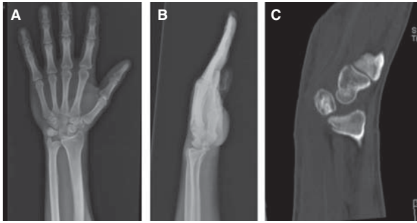
Figure 1. Preoperative X-rays (a and b) and CT scan (c) showing volar dislocation of the lunate bone.