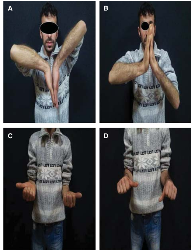
Figure 3. Clinical photos showing the functional results of the patients at second year postoperatively (a, b, c, and d).

was successfully reduced. After anatomical reduction was achieved, fixation was applied using K-wires. A fluoroscopic control revealed normal carpal bone relationship, and both volar and dorsal capsules were repaired (Figure 2). A short arm cast was applied for 8 weeks. Three months postoperatively, all K-wires were removed, and physiotherapy