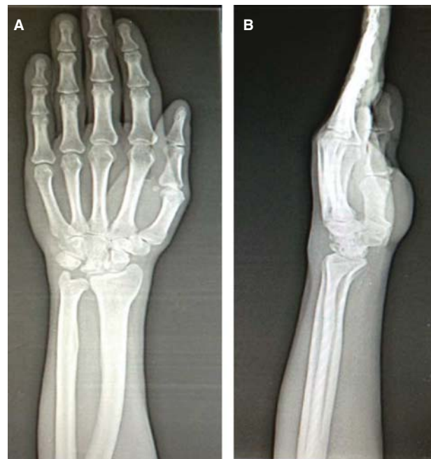
Figure 4. X-rays at second year of the operations showing the lunate to be in reduced position but has been collapsed (a and b).

was successfully reduced. After anatomical reduction was achieved, fixation was applied using K-wires. A fluoroscopic control revealed normal carpal bone relationship, and both volar and dorsal capsules were repaired (Figure 2). A short arm cast was applied for 8 weeks. Three months postoperatively, all K-wires were removed, and physiotherapy