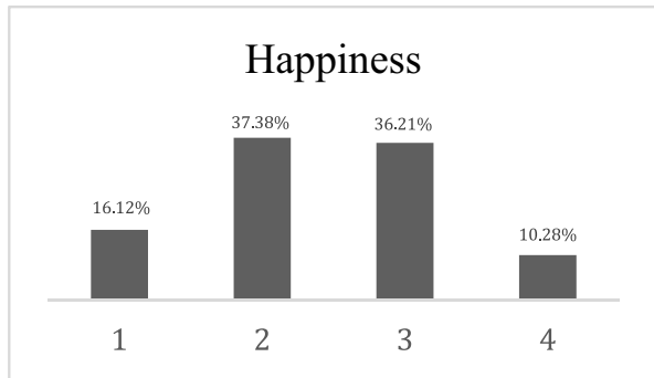
Fig. 2 Reported happiness

because there were no excess values, because skewness-kurtosis values were within \pm 2 when divided to standard errors, and because the values obtained after dividing the interval between quarters by standard deviation are 1.3. The Dependent Sample t-Test results implemented as such are given in Table 1.