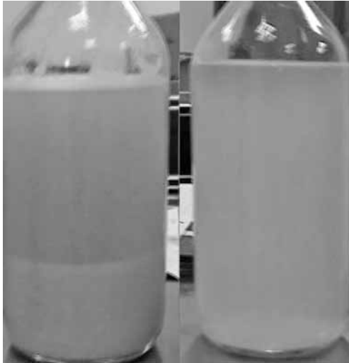
Figure 1. Appearance of viscous, milky lipoprotein material removed by lavage. Bottle on left was obtained from the very first cycle, precipitation of lipoprotein material at the bottom was noted. Bottle on right is from the last cycle of same patient.

position. The initial returns were typically very milky or turbid and we repeated the process of filling and draining the lungs with saline until the fluid recovered was clear (Figure 1). We performed whole lung lavage procedures in an identical way, each lung being lavaged with volumes of 15-30 L of saline solution. At the end of the procedure, the residual saline from the lung and resumed ventilation with 100% oxygen was drained and aspirated. We replaced the double lumen tube with a single lumen tube and examined the endobronchial system by a fiberoptic bronchoscope to check for the patency and to aspirate the remaining lavage fluid. Vital parameters such as arterial saturation of