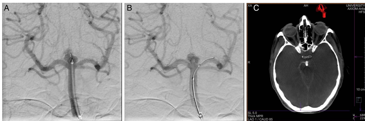
Figure 3 Procedural perforation with the Woven EndoBridge (WEB) device. A woman with an unruptured basilar apex aneurysm presented for treatment with WEB. Immediately following detachment of the Double Layer (DL) device, the microcatheter was advanced distally into the proximal aspect of the aneurysm. Angiography following the detachment demonstrated a small amount of active contrast extravasation from the aneurysm dome (A). Heparinization was reversed with protamine and a Hyperform 4×7 mm balloon (Medtronic; Irvine, California, USA) was transiently inflated within the mid-basilar artery. Angiography was repeated, demonstrating resolution of the extravasation, despite residual filling of the aneurysm (B). Cone beam CT performed at the conclusion of the treatment showed a small amount of contrast extravasation within the interpeduncular cistern (C). The patient experienced no neurological sequelae from the transient extravasation.

Consistent with previous studies, the rates of major procedural and peri-procedural complications associated with WEB treatment were low, with only a single major peri-procedural stroke observed during the study (0.7%). 9–12 Moreover, this complication (a delayed lobar parenchymal hemorrhage occurring 22 days after treatment) is of uncertain relation to the actual index procedure. At the same time, rates of less severe peri-procedural ischemic events (7 minor strokes, 4.7%) and hemorrhagic events (2 SAHs, 1.4%) were similar to those reported in other studies of endovascular aneurysm treatment. Of note, only two of these patients with neurological events which did not reach the PSE criteria experienced increases in their mRS