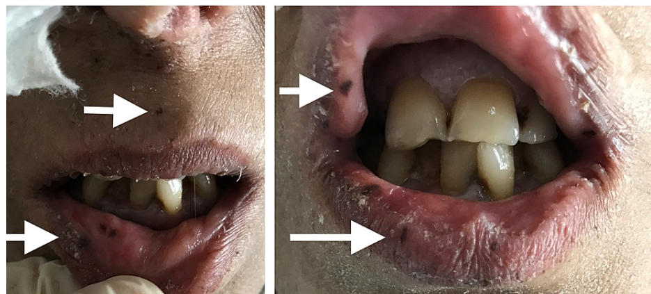
FIGURE 1: Black spots localized in the perioral area (white arrows)

Ergenç et al. This is an open access article distributed under the terms of the Creative Commons Attribution License CC-BY 4.0., which permits unrestricted use, distribution, and reproduction in any medium, provided the original author and source are credited.