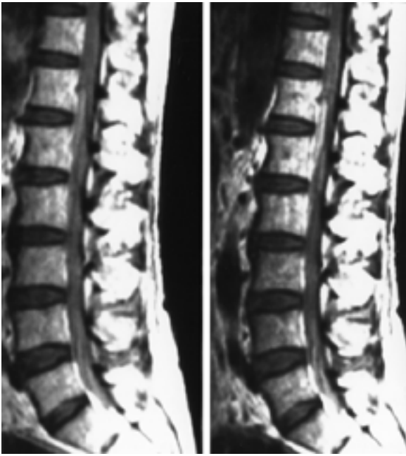
Fig. 1. Left : A noncontrast T 1 -weighted sagittal MR image revealing a hyperintense mass in the subdural space at T-12 extending to L-5. Right : The mass enhanced slightly with intravenous administration of Gd.

tion was complete, the distended arachnoid sac, which also contained clotted blood, was gently separated from the roots of the cauda equina. No other abnormality, such as tumor or vascular malformation, was found at the site of the hematoma. Results of subsequent electromyography studies demonstrated the prolonged bulbocavernosus reflex latencies consistent with CES. The patient's neurological condition remained unchanged during the first 10 days after laminectomy, so he was referred for rehabilita-