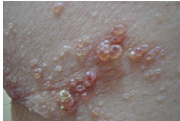
Fig. 1: Left subaxillary regions showing multiple vesicles and bullae of varying size. There is oozing of clear fluid from papulovesicular lesions.

translucent vesicles and bullae. There was associated pain, chronic drainage, and itching. The vesicles typically measure 2-15 mm in diameter (Fig. 1). We performed biopsy from lesions. On microscopic examination, the lesions surface was hyperkeratotic. Coexisting lymphedema was present in the papillary dermis. There were superficial dilated lymph vessels, lined by flat endothelial cells in a discontinuous layer, situated immediately beneath the epidermis (Fig. 2). There was fibrosis in the deep dermis and few mononuclear inflammatory cells throughout the papillary and reticular dermis. With these clinical and histological findings the patient was diagnosed as acquired lymphangiectasis.