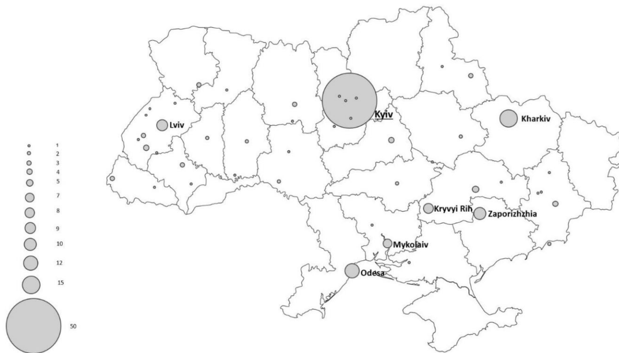
Figure 1: Location of dialysis units in Ukraine, where patients were dialyzed before the displacement and number of these patients.