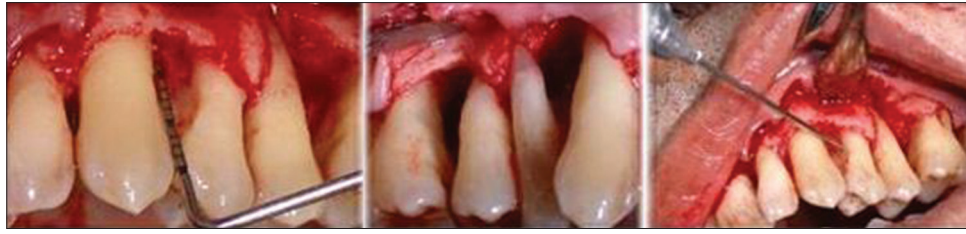
Figure 3: Clinical view of the intrabony defects during maxillary flap operation