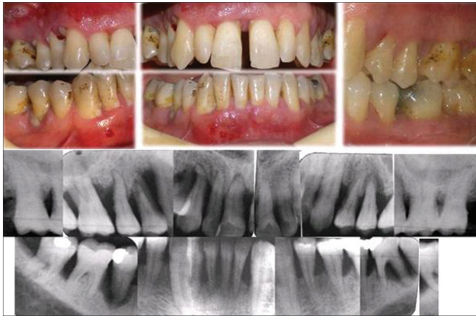
Figure 1: Clinical and radiographic view of the patient before initial periodontal therapy

as well as resective procedures was planned for the treatment.