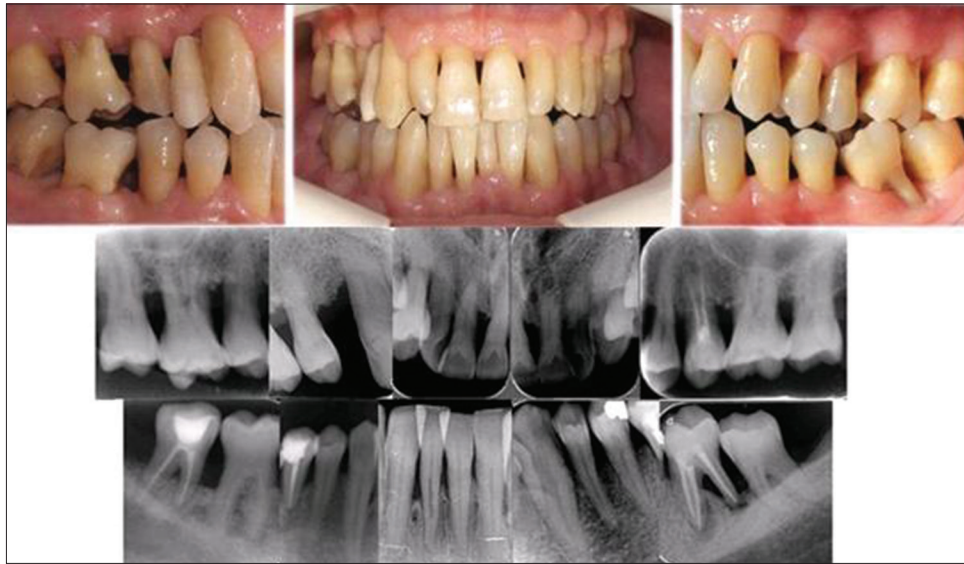
Figure 5: Clinical and radiographic view 84 months after the operations

Based on existing evidence, the American Academy of Periodontology suggested several indications for gingival augmentation procedures. [8] We placed FGG onto the insufficient keratinized tissue zones after IPT before flap surgeries.