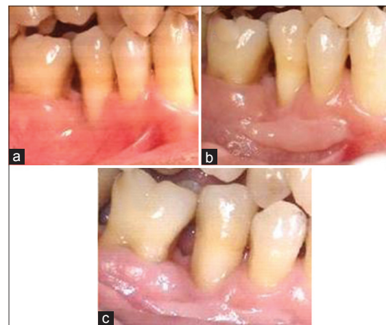
Figure 2: (a) One of the free gingival grafts placed on inadequate keratinized tissue zones (b) one month after (c) 12 months after clinical view

The flap surgeries were performed in two separate sessions as for maxilla and mandible. Enamel matrix derivatives (EMD) in gel form (Emdogain®, Straumann) and bovine-derived xenograft (BDX) (BioOss®, Geistlich) combination was used for the treatment of intrabony defects [Figure 3]. For postoperative care the patient received amoxicillin + potassium clavulanate twice a day for 7 days, naproxen sodium, twice a day for 7 days and 0.12% chlorhexidine + benzydamine hydrochloride mouth rinse, twice a day for 4 weeks. Mechanical tooth cleaning was not allowed in the surgical area for the first 4 postoperative weeks. Sutures were removed at 14 days following the surgery. Patient was put on strict recall visits (every 2 nd week during the first 2 months postoperatively and once a month for the 1-year observation period). Supportive periodontal treatment was carried out with 4–6 months intervals after 1-year. However, at the 5 th year the patient was irregular with his