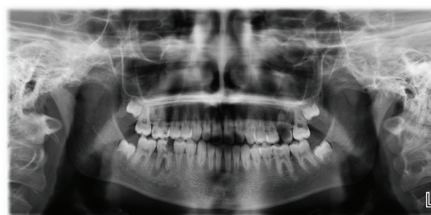
Figure 1. In the panoramic radiograph of a patient who received treatment for Ewing sarcoma, root shortening is present in all teeth