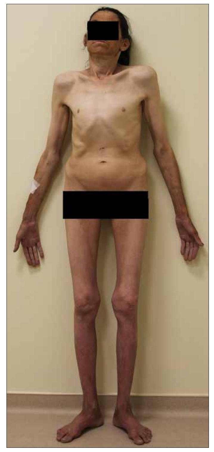
Figure 1. Gross appearance of the patient revealing macrocephaly, acromegaloid facial appearance, arachnodactyly, pectus carinatum, bilateral amazia, and mild scoliosis

chromosomal abnormalities. All 12 exons of the LMNA gene were screened for mutations by direct sequencing, but no mutations were detected. The patient was discharged on the fifth day of hospitalization. Due to non-adherence to the medical treatment, there were recurrent hospitalizations with heart failure decompensation, and she died 4 months after diagnosis.