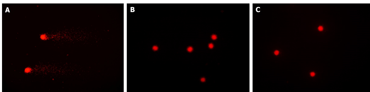
FIGURE 1. Images of comets from burn injury (A), NAE-8® treatment after burn injury (B), and SSD treatment after burn injury (C).

GSH: Glutathione; IL-1 \beta : Interleukin-1 \beta ; MDA: Malondialdehyde; MPO: Myeloperoxidase; NAE-8®: Aloe vera-based extract of Nerium oleander; TNF- \alpha : Tumor necrosis factor; SSD: 1% silver sulphadiazinesulfadiazine; %DNAT: The percentages of DNA in tail.