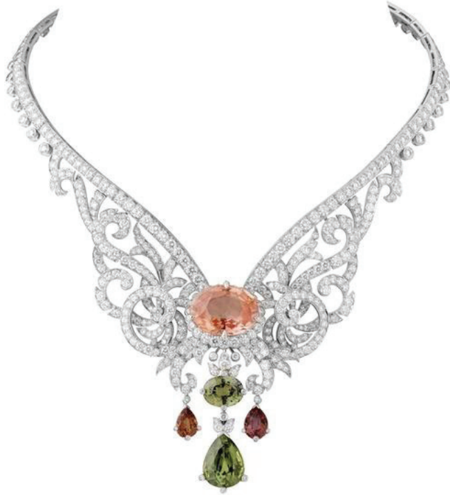
IV. Figure §§