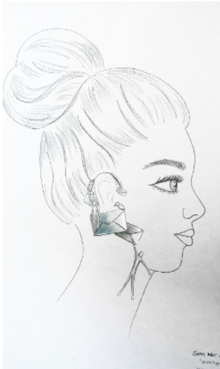
Fig. 1. Second grade, “Letter” themed student design

Aygül Aykut expresses as: The basic thinking processes as sense, perception and design have a special composition in art. Image is a result of both observation and abstraction but it is not a mechanical combination of these two, [1].