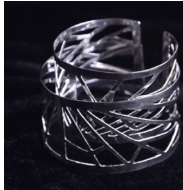
Fig. 9. Fourth grade, "Letter" themed student design and application