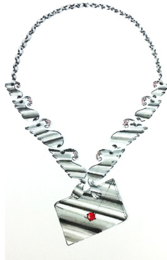
Fig. 2. Second grade, “Letter” themed student design

In Jewelry Design Programmes, the knowledge of light, colour and design should be thought on basis of theories and causations besides visibility and practice. The education of design provides the students an independent aspect and encourages researching and questioning when supported by theoretical knowledge as art history, aesthetics, and sociology of art, arts policy and analyzation of works of arts. Students raised in this spirit create awareness as they can grow their commentations.