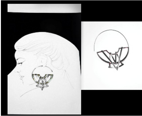
Fig. 6. Fourth grade, "Letter" themed student design and application