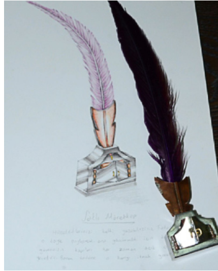
Fig. 3. Third grade, “Letter” themed student designs and applications