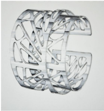
Fig. 8. Fourth grade, "Letter" themed student design and application