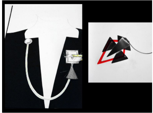
Fig. 7. Fourth grade, "Letter" themed student design and application