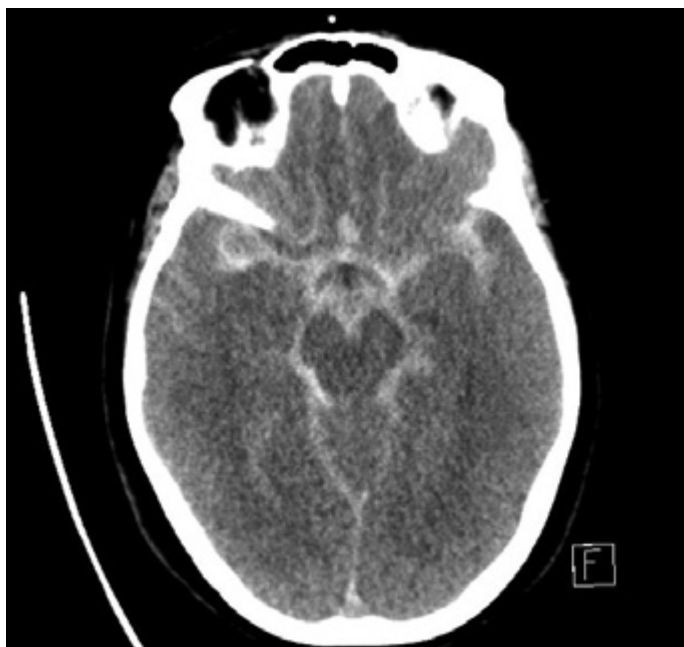
Figure 2. Cranial CT before PTCA shows diffuse subarachnoid hemorrhage and an aneurysm in the right MCA