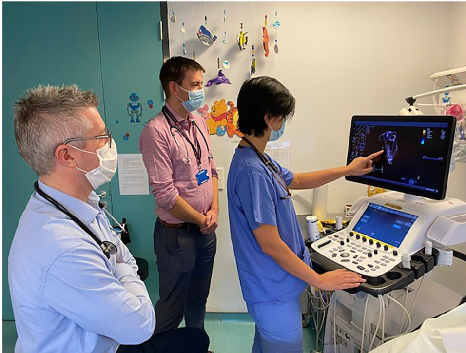
Figure 1. Competency-based medical education. A paediatric cardiology fellow undergoes end of year assessment by two trainers at an OSCE echocardiography station. Entrustable professional activities are increasingly being used to bridge competencies and clinical practice with trainees assessed on their capability (entrustment scale).

However, the training is either not formally recognised (accredited) or the Ministry of Health in that country does not (or refuses to) recognise paediatric cardiology as a distinct subspecialty of medicine.