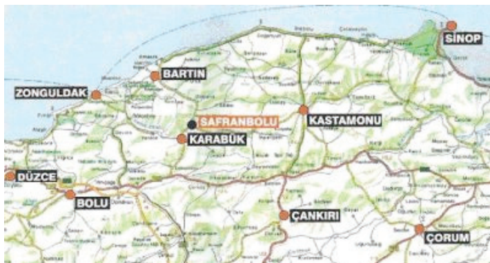
Fig. 1-a: Location Map of Safranbolu ( www.safranbolu.gov.tr )

Safranbolu is a town in Karabük in the Black Sea Region in Turkey. Its distance to Black Sea is nearly 60 km. It is surrounded by Bartın province in the North, Düzce and Bolu provinces in the West, Çankırı in the South and Kastamonu in the East. Safranbolu is in 41° - 15' North parallels and 32° - 42' east meridians. It was part of Kastamonu Province until 1923 and Zonguldak Province between 1923 and 1995.