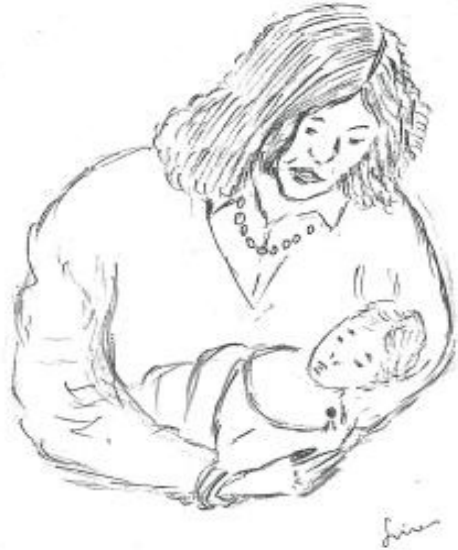
Fig. 2. When it comes to raising children, many mothers cling to the old practices, even if some of them contrast with the advice provided by modern medical authorities. (illustration by the author — S.C.)