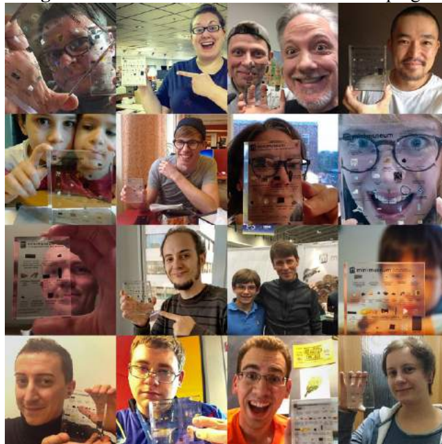
Figure 4: Advertisement Process of the Campaign

The owner of the campaign moved his supporters into this platform via visual in Figure 4. This gave the campaign the feature of transmediatic storytelling. In other words, different people from different layers supported the campaign. This is important in terms of sustainability of the communication. In the “Comment” part of the campaign, the owner of the campaign replied to each and every one of the participants.