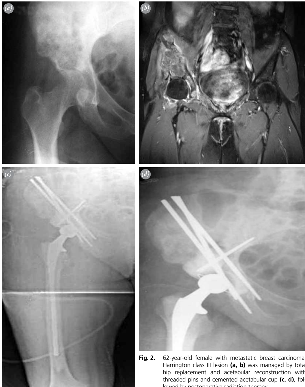
Fig. 2. 62-year-old female with metastatic breast carcinoma. Harrington class III lesion ( a, b ) was managed by total hip replacement and acetabular reconstruction with threaded pins and cemented acetabular cup ( c, d ), followed by postoperative radiation therapy.

mental proximal femoral resection. The remaining patients had standard (6 patients) or 175–225 mm long-stemmed (7 patients) femoral components. The first step of acetabular reconstruction was antegrade insertion of fully or partially threaded Steinmann pins through the ilium down to the acetabular floor. The number of threaded pins varied according to the anatomy of the defect. Threaded Steinmann pins were supplemented by unthreaded pins or K-wires in some cases. The second step consisted of cementing an acetabular reinforcement