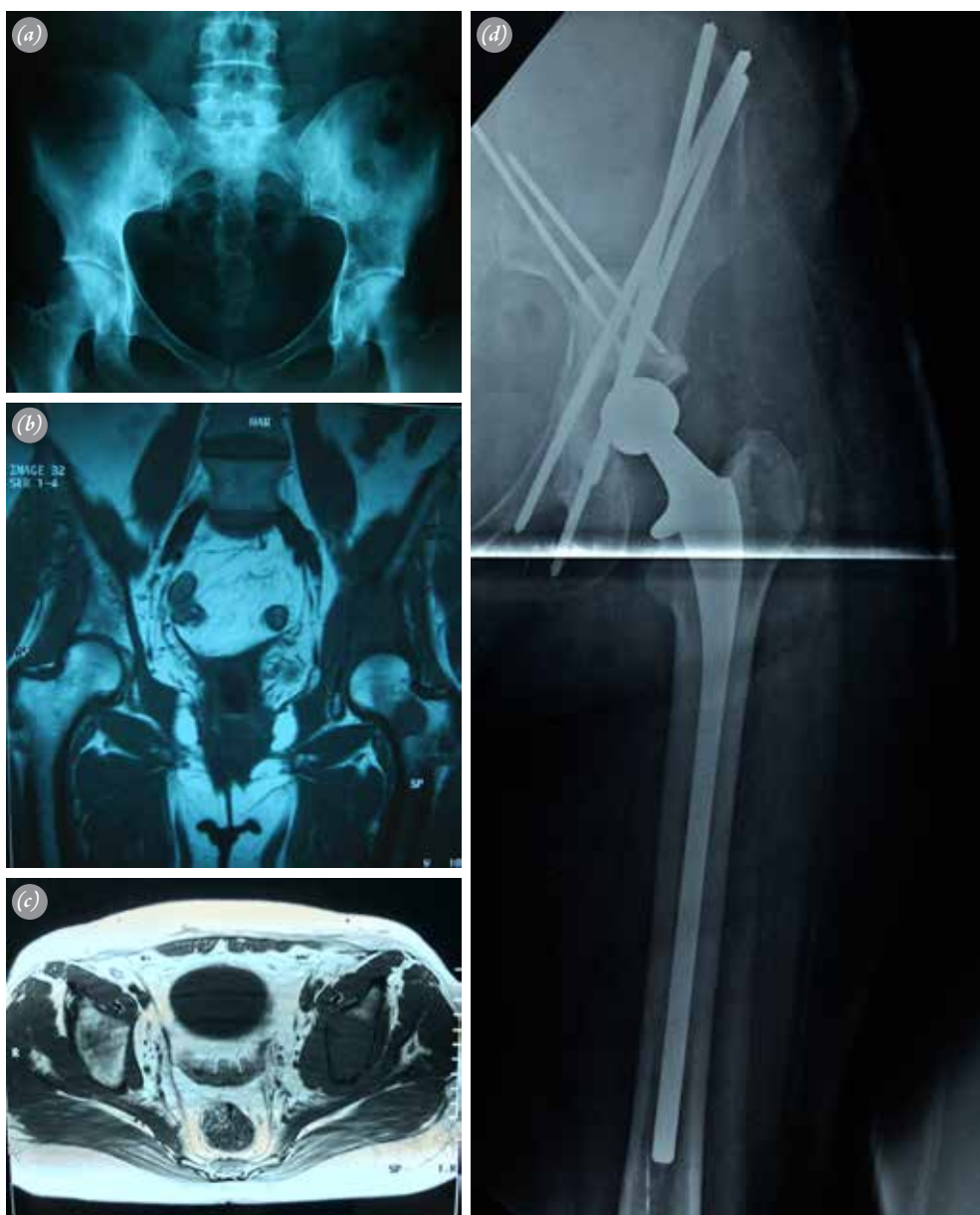
Fig. 1. 48-year-old female with metastatic breast carcinoma. Radiograph and magnetic resonance imaging of the pelvis showed extensive involvement of the periacetabular region. A metastatic lesion in the femoral neck was also seen (a–c). This Harrington class III lesion was managed by total hip replacement and acetabular reconstruction with threaded pins and cemented acetabular cup (d). Postoperative radiation therapy was also applied. [Color figures can be viewed in the online issue, which is available at www.aott.org.tr ]

Periacetabular defects were categorized based on Harrington's classification: class I: periacetabular lesion with intact roof, medial wall and lateral cortices; class II: deficient medial wall; and class III: deficient roof and lateral cortices. [2] Radiological assessment revealed Harrington class II lesions in 7 and class III lesions in