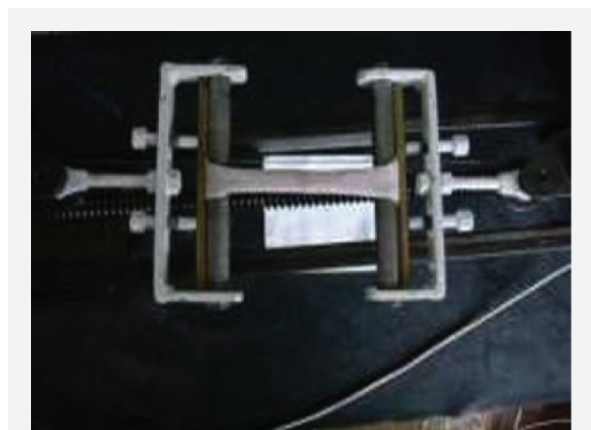
Fig. 1. Measurement of a tensile strength of the wound tissue via a tensiometer.

(Fig. 1). Application of the force was continued until a tear developed anywhere along the incision. A graph reflecting the force applied to the tissue was obtained by a pencil and paper attached to the tensiometer. When a tear occurred, a sudden decrease in the line was detected, and the value corresponding to this decrease on the graph was recorded. This value was the power of the tear force expressed in kilograms. The breaking strength force per unit of tissue was calculated by dividing the measured force by the wound length.