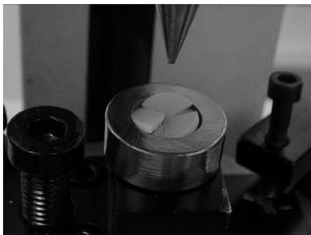
Figure 3 Biaxial flexure testing.

In studies on the repeated firing of ceramics, firing periods were limited to between one and nine times. 6,17,23-26 The first firing serves to eliminate microcracks and release the stresses associated with the grinding and polishing procedures, as recommended by the manufacturers. 7 The second and third firings are considered to be necessary steps for producing the restoration using the staining or layering technique, prior to installation in the mouth. The