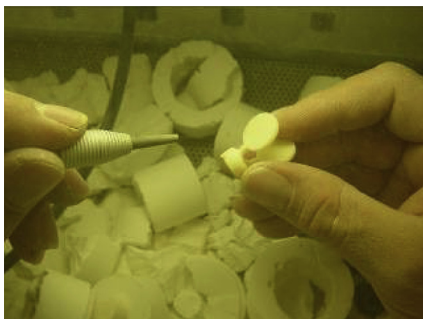
Figure 2 Removal of investment material by an air-abrasion unit.

Vivadent, Schaan, Liechtenstein) and leucite-reinforced materials [Finesse (Ceramco, Burlington, NJ, USA), Cergo (Degussa Dental, Dusseldorf, Germany), and Evopress (Wegold Edelmetalle, Wendelstein, Germany)] were tested. Forty disc specimens were prepared for each material according to the manufacturers' instructions.