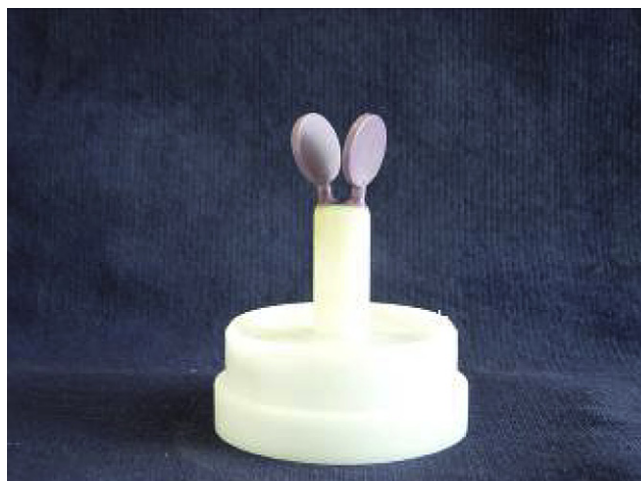
Figure 1 Sprued prefabricated wax discs.