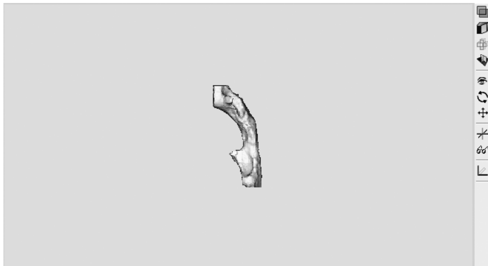
Figure 2. 3D reconstruction of PA.

The expansion device used was an acrylic cap splint Hyrax (GH Wire Company, Hanover, Germany). The expansion screw was activated twice a day for a period of 10 days. Patients were treated with maxillary protraction for an average period of 10 months. Maxillary protraction was performed using a FM on the seventh day of RME. The FM treatment was terminated and the Hyrax appliance was removed when an overjet of 5 mm and full Class II molar and canine relationship were achieved. All patients received a Class III bionator for retention. Upon