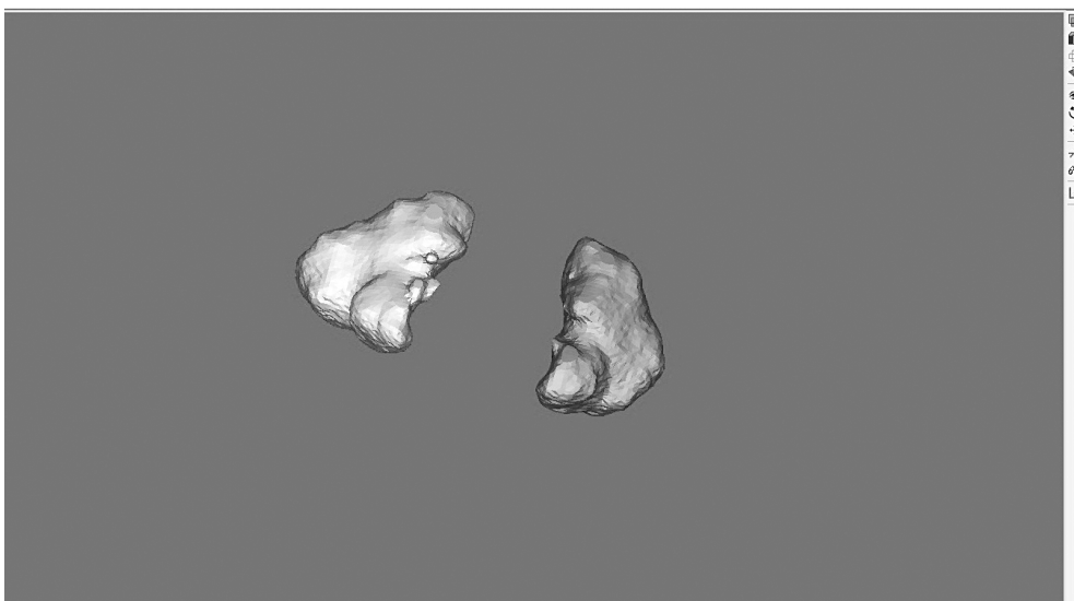
Figure 4. Isolation of right maxillary sinus.

The data obtained from the images were transferred to a computer, where volumetric changes of the PA and maxillary sinuses and several skeletal changes were measured using MIMICS 14.0 software launched by Materialise (Materialise Europe, World Headquarters, Leuven, Belgium). All measurements were done by the same operator. In order to determine the method error, 10 randomly selected CBCTs were retraced on the same computer by the same operator. Before landmark identification, the 3D volumetric images were oriented with the MIMICS 14.0 program.