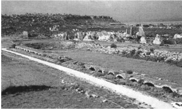
Stadium of Perge II; Stadium of Aizonai.