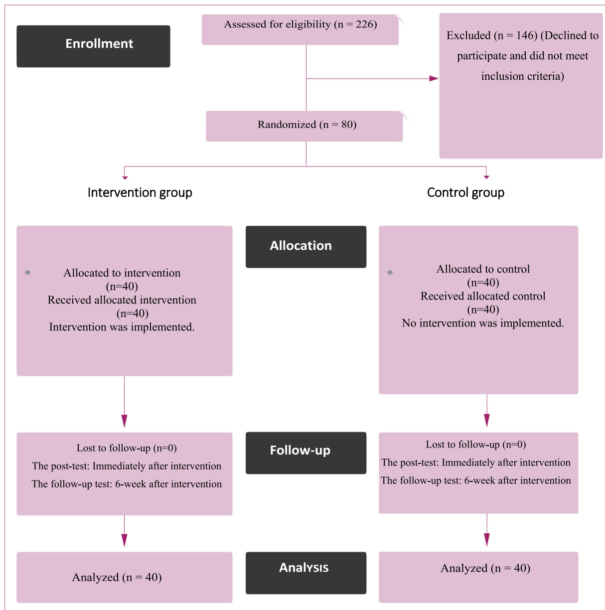
Fig. 1. Consort flow diagram.

comprehension problems, and being 18 years of age or older.