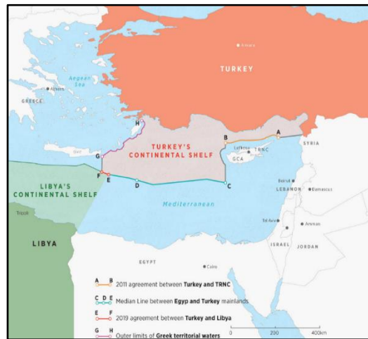
Figure 2. Turkey-Libya Maritime Boundary Delimitation Agreement (Alhas, 2019)

The agreement was approved by the Presidential Council on December 6 th , 2019 and adopted in the Libyan law. Two countries can conduct research activities in the determined areas within the context of it. This bilateral agreement was declared to the UN by Turkey and Libya. (UNGA Res., A/74/634, 2019) Through this agreement, Turkey and Libya are now neighbors from sea and have the opposite shores to one another. (Yaycı, 2020:160)